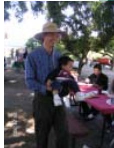
Scarecrows, raffles, picnics, and more -- fun for all ages!