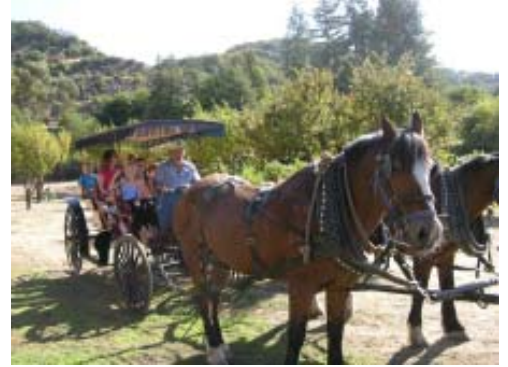
Muir Heritage Land Trust