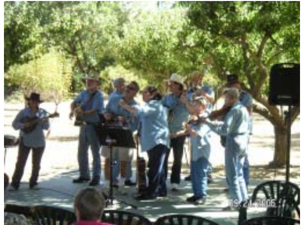
Spinning Wheel Band