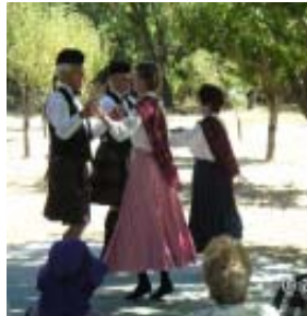
New World Scottish Dancers