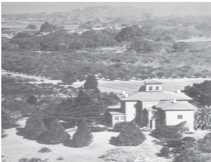
Table grapes, Zinfandel wine grapes, pears, cherries, peaches, and apricots were the primary cash crops grown on the Strentzel/Muir ranch

Guidelines are available on our website ( www.johnmuir.org/martinez ) for the 2006 John Muir Conservation Award. The deadline for submission is March 31, 2006.