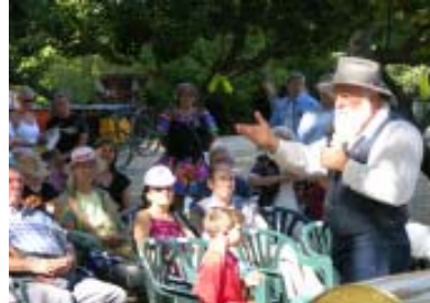
Muir Heritage Land Trust