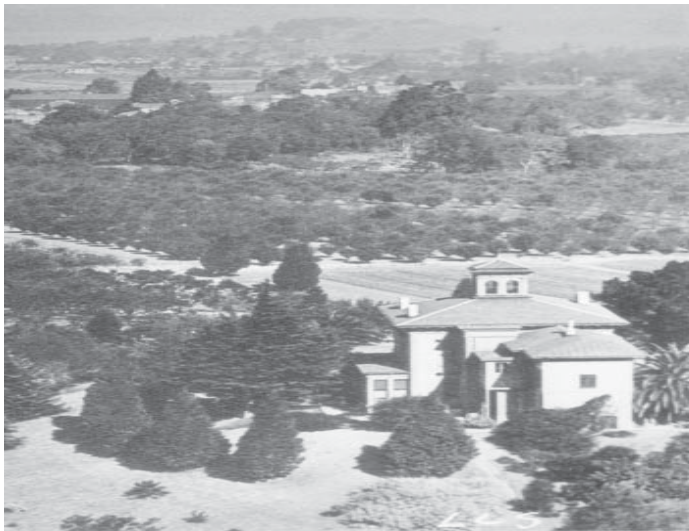
Table grapes, Zinfandel wine grapes, pears, cherries, peaches, and apricots were the primary cash crops grown on the Strentzel/Muir ranch

Guidelines are available on our website ( www.johnmuir.org/martinez ) for the 2006 John Muir Conservation Award. The deadline for submission is March 31, 2006.