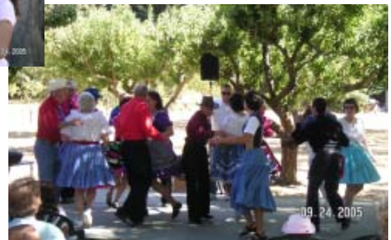
Square Dancers of Contra Costa County