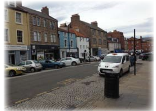
High Street in Dunbar, Scotland. John Muir's Birthplace (white building) and the home where he grew up (next to it, right) are shown.

The main meetings of the visit took place on May 21-22 in Dunbar. Our delegation made the same journey from Edinburgh that John Muir made by train in July 1893 on his return to